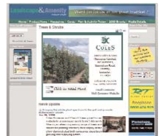
Product News Sponsor

The news story is then added to www.landscapeandamenity.com , with product enquiry services still operative via the online enquiry service. There are between 5-8 news stories per eBulletin, and are available for only £135.00