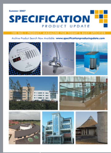
PRODUCT LED FRONT COVER

Alongside the printed publication we offer a comprehensive online service. This ensures that each issue is seen by the widest possible audience, with both web site and digital versions available. Accessed via specificationproductupdate.com the website provides a comprehensive product listing and archive search facility. The digital version of Specification Product Update is highly readable, allowing specifiers to view each issue on screen in a turn-page format. This means that instead of a static image you can enhance your entry with both video or flash animation.