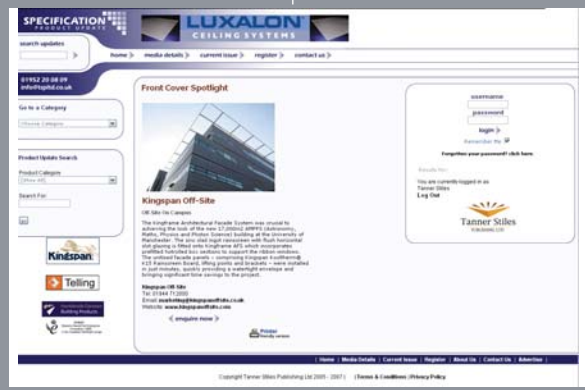
UP TO THE MINUTE WEB CONTENT