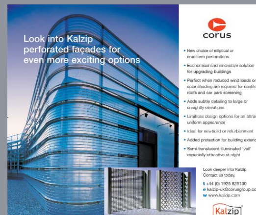
TYPICAL PRODUCT CARD